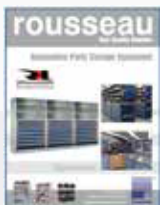
Automotive Parts Equipment