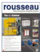
The "L" cabinet

For now, three of these documents are available: The "L" Cabinet , The "R" Cabinet and L50 - Electronic Lock System . They can be found in the Literature section on e-rousseau. Other documents featuring different product lines will be developed during 2015, so watch this space!