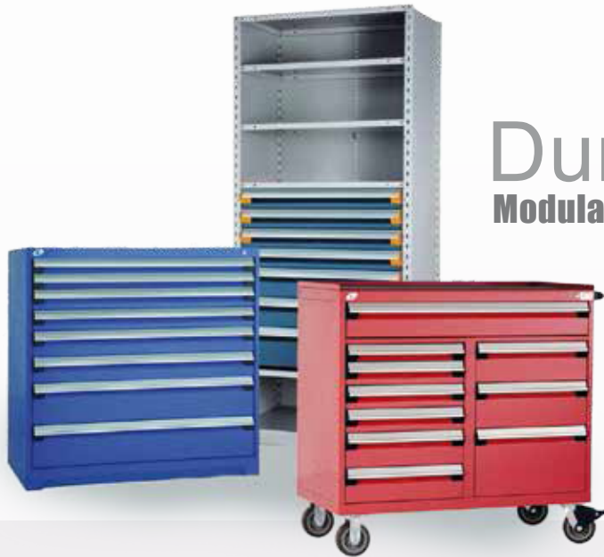
Durability Modular Drawer System