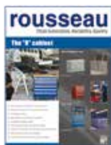
The "R" cabinet