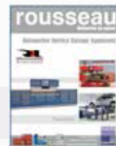
Automotive Service Equipment