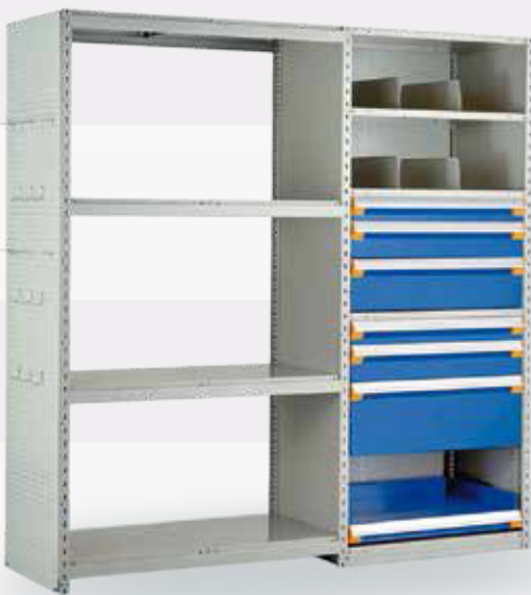
Organization Workstation System