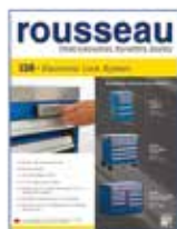
L50 - Electronic Lock System