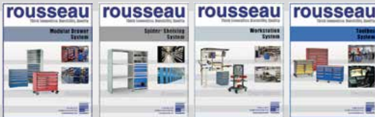
Modular Drawer System