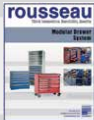
Modular Drawer System