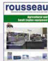
Agricultural and Small Engine Equipment