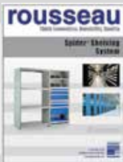
Spider® Shelving System