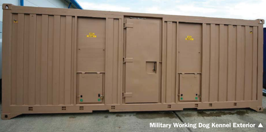
Military Working Dog Kennel Exterior ▲