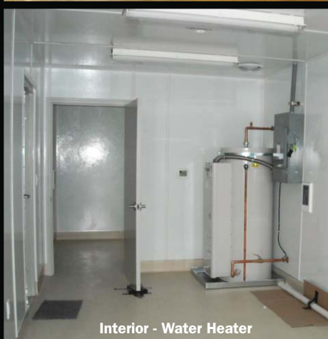
Interior - Water Heater