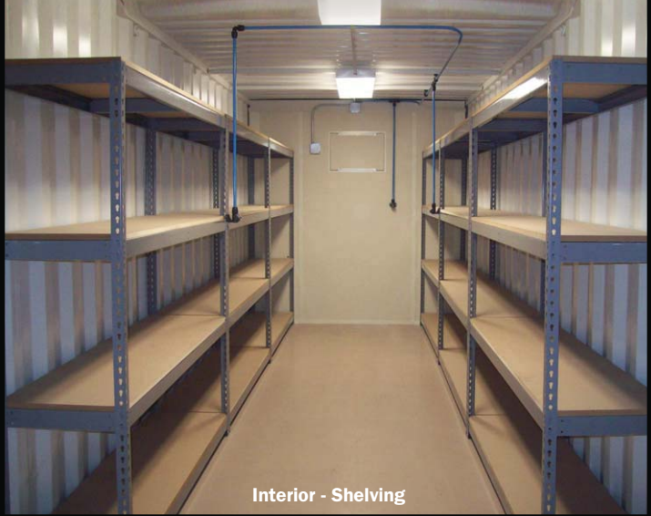
Interior - Shelving