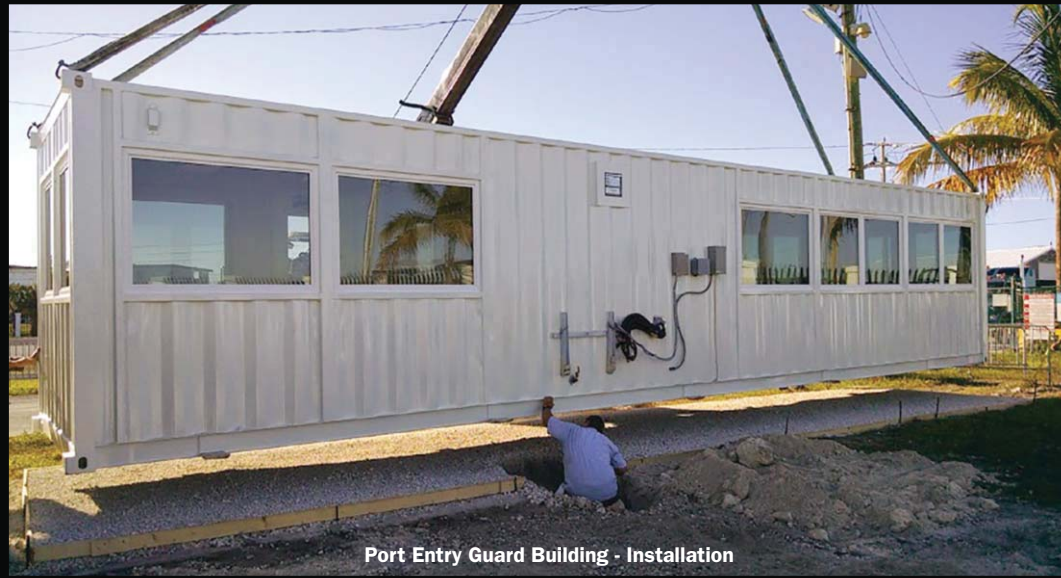
Port Entry Guard Building - Installation

Ebtech sandwich systems are used to address customer requirements whether they are insulation, climate control, or ballistic and blast mitigation driven. Ebtech provides durable, economical, and attractive modular designs for industrial, military and emergency housing solutions.